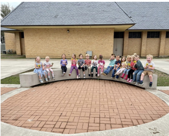
Top row: Toddler 1

class playing with balloons; Pre-K making Fizzing Shamrocks for "green day"; Preschool: Lesson on Little Miss Muffet; Pre-K in space!