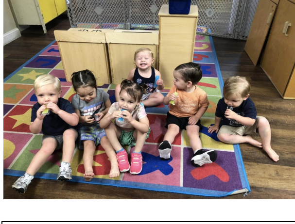
Top row: Preschool pre 4th celebration. Science Day in Pre K. Tiny Tots playing on water day.