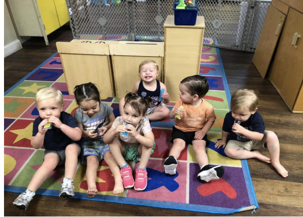
Top row: Preschool pre 4th celebration. Science Day in Pre K. Tiny Tots playing on water day. Bottom Row: Toddler 1 Popsicle break.

In case of emergency pastoral care need, please call or text Pastor Cheryl at 940-613-5375.