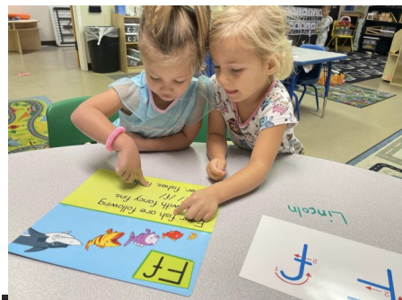
Right: Pre-K Fish is for Fish; Toddler 1 Halloween Treats