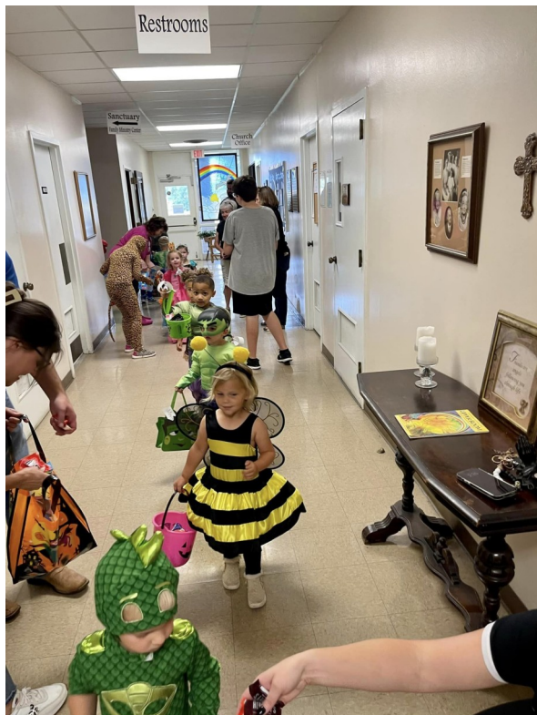
Left: Pre-School trick-or-treat.