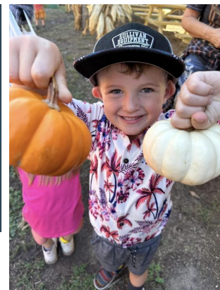
Left to right: Pre-K Chapel, Toddler 2 checks out the fire truck; all smiles in Toddler 1; Pre-K at the pumpkin patch!